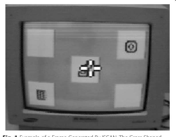
Fig. 1 Example of a Frame Generated By ISCAN. The Cross-Shaped Cursor Represents the Location Where the Participant Directing His/Her Focus at the Time of Image Capture